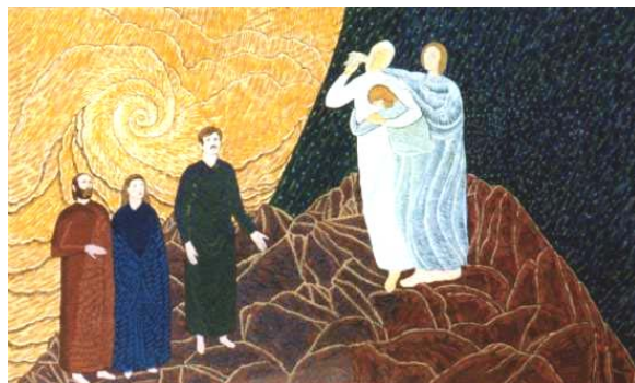
"Transfiguration", Bertrand Bahuët, 1995, St. Peter's Chapel, Curbans, France