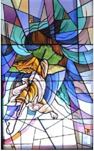
Amos, Stained Glass, Christ Church, Pompton Lakes, NJ