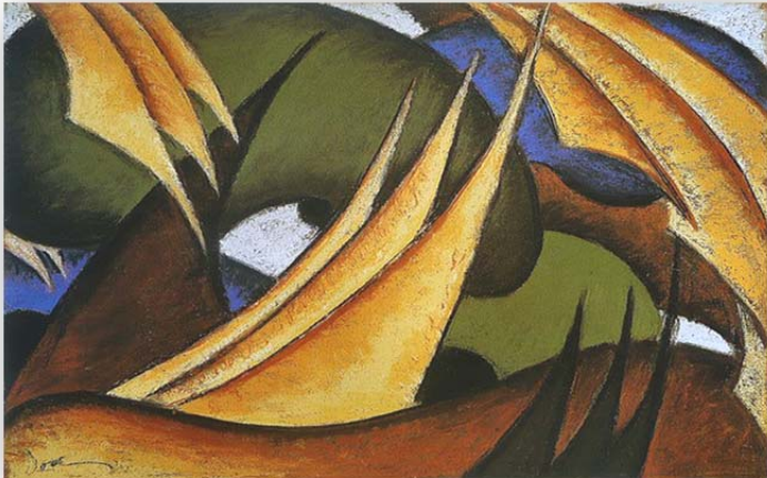
Ten Commandments , Arthur Dove, 1912

— from Psalms 19:1-11 and 119:111-112, 135