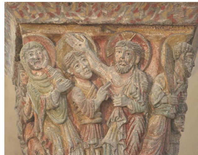
Doubting Thomas , 12 th Century, France